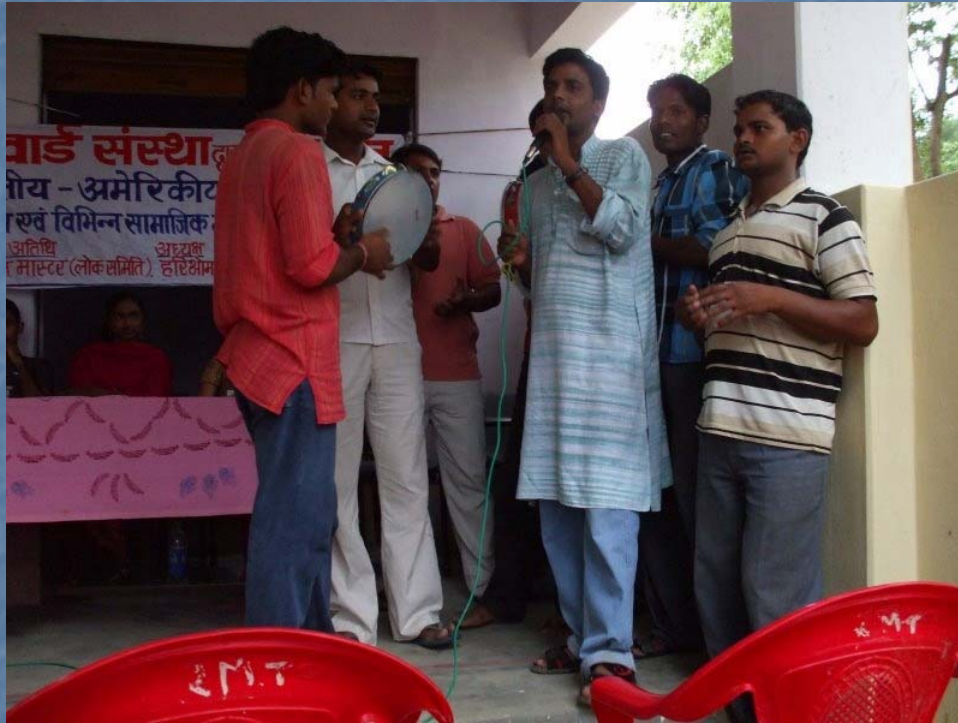
Lok Samiti performing before a village meeting